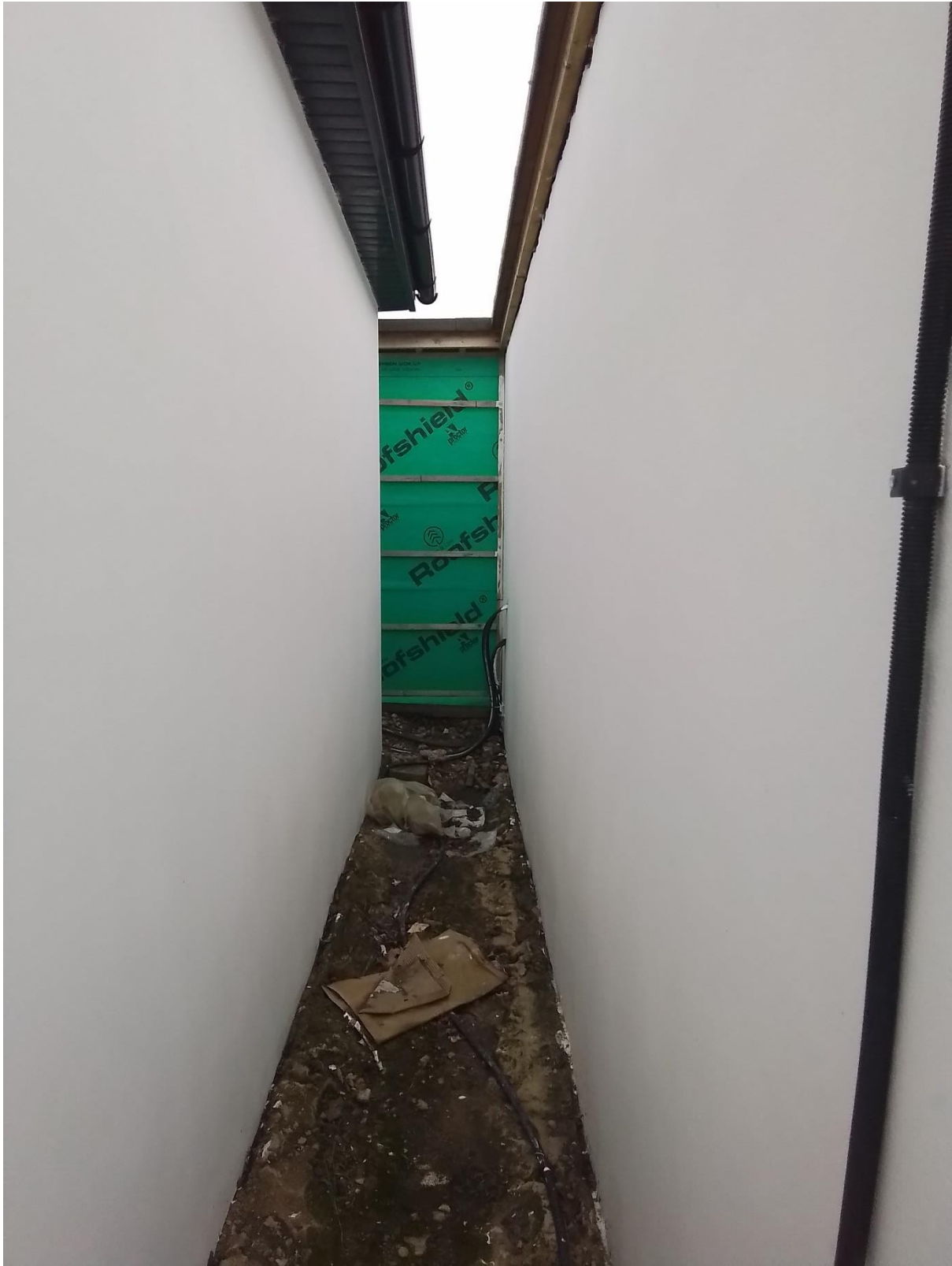
Rear of garage White Barn