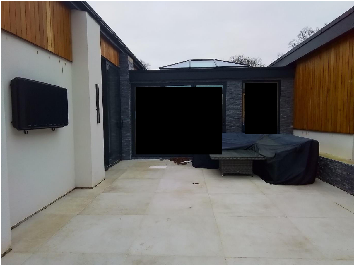
Connecting corridor looking NW