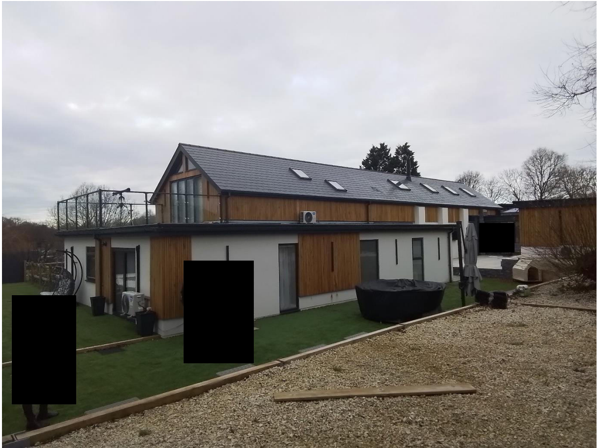
North elevation and wrap around extension