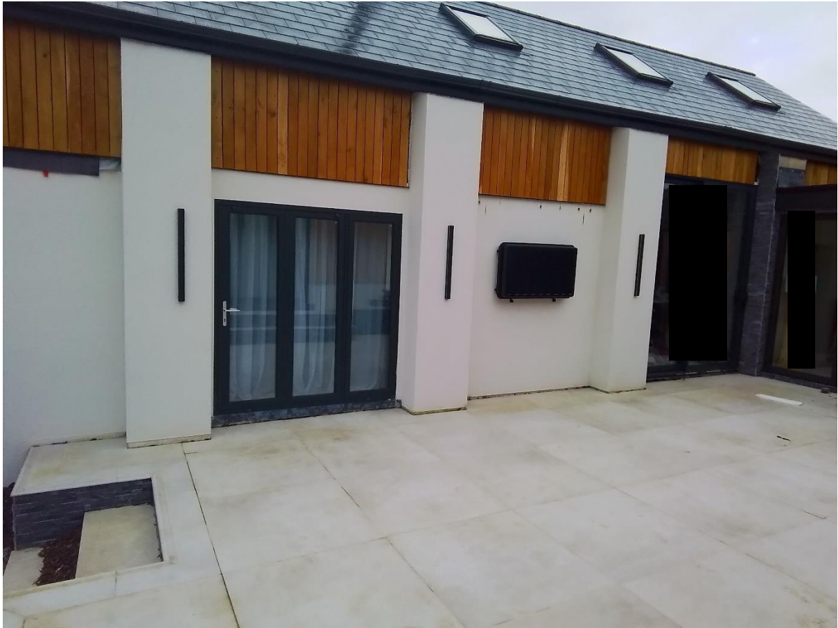
North rear view of White Barn with connecting corridor to right