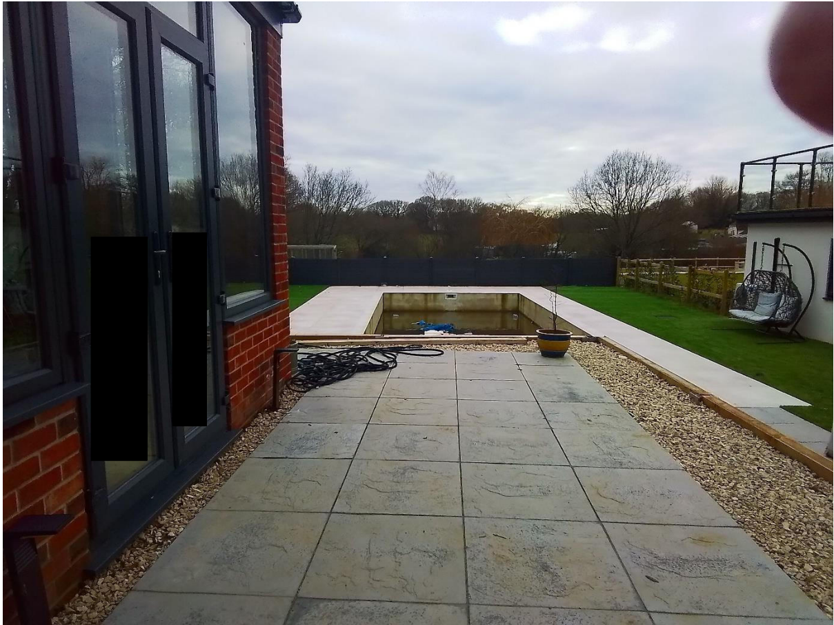
Greenhouse and swimming pool looking south