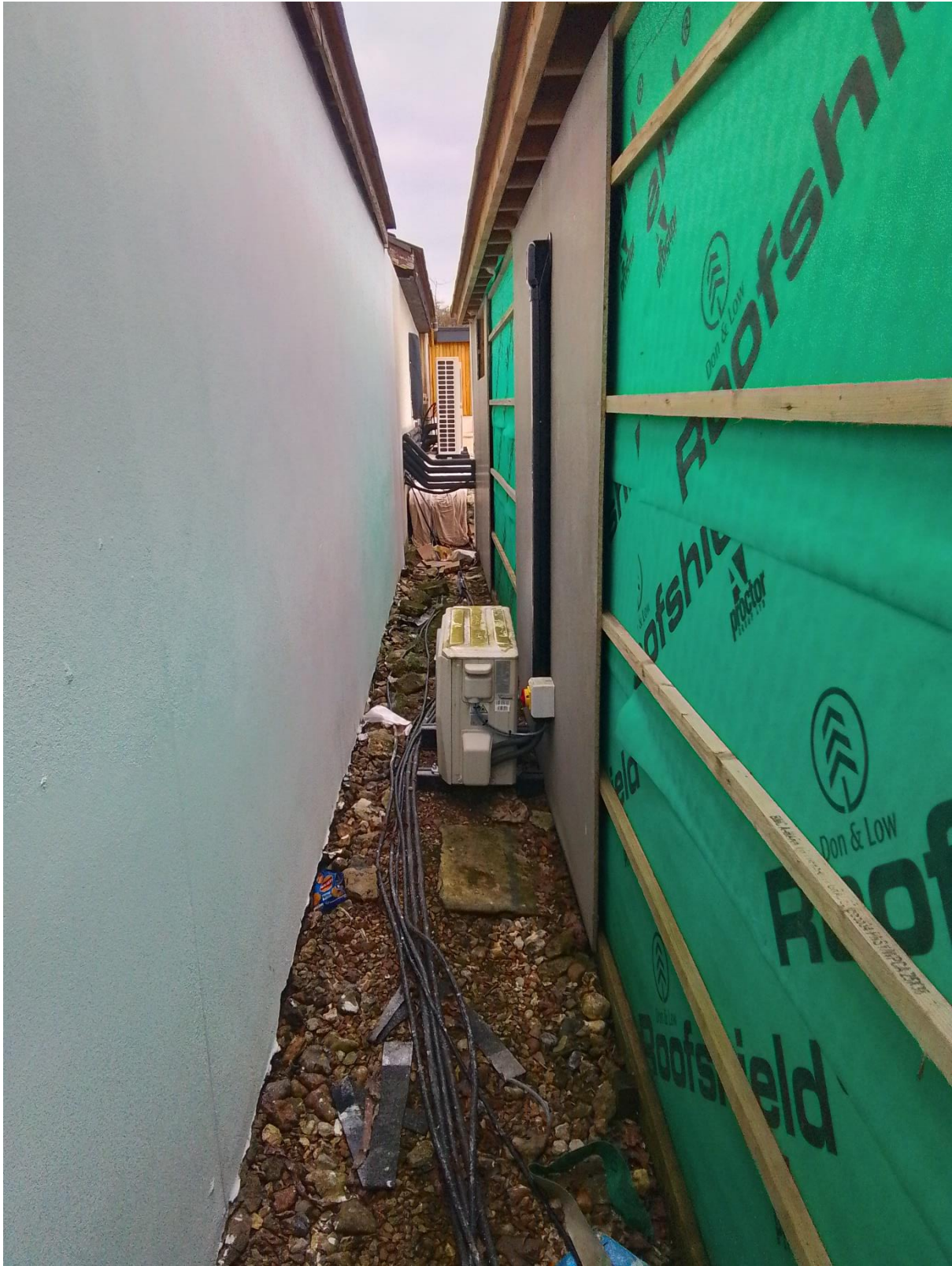
Rear of outbuildings White Barn