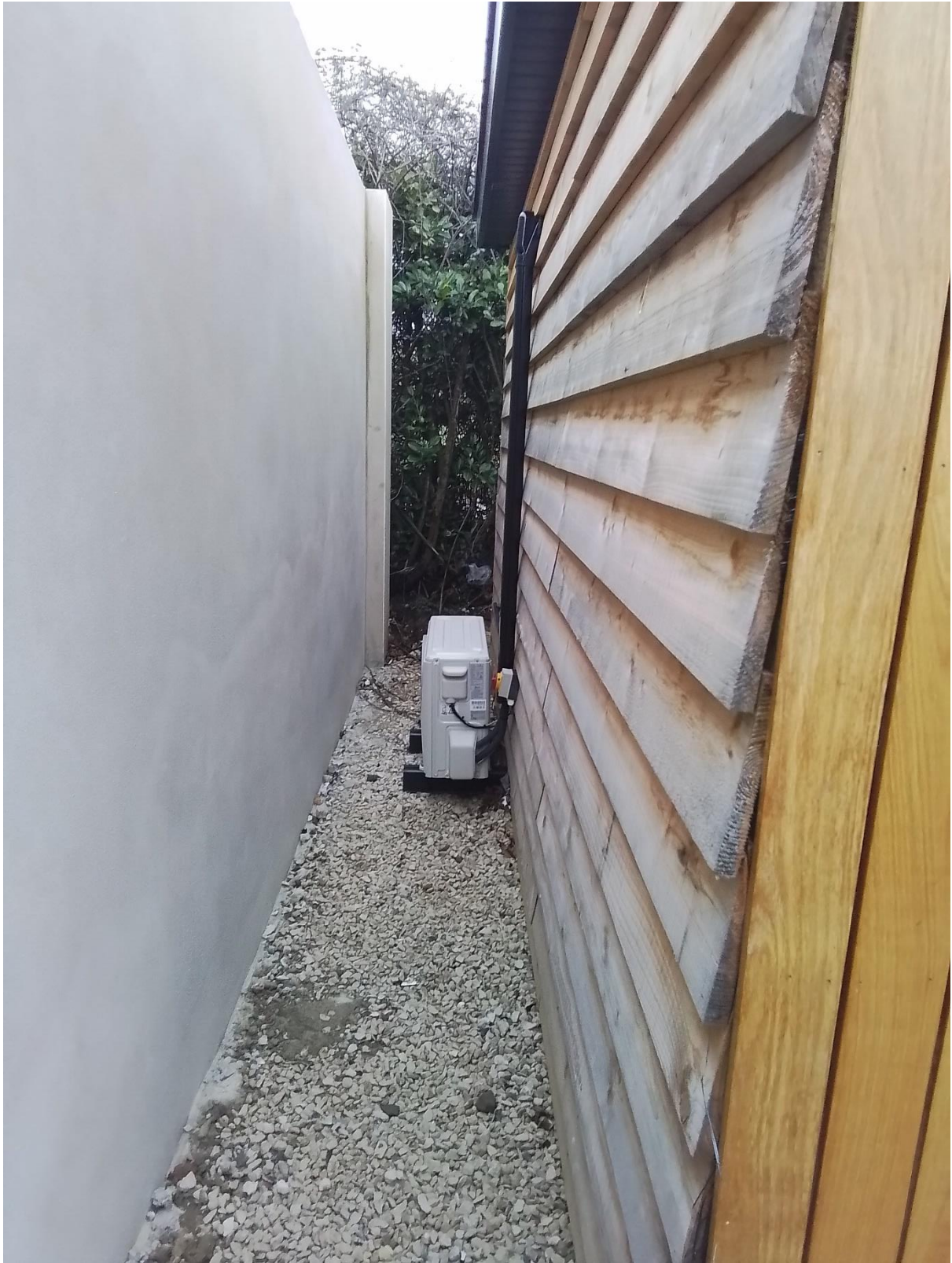
Rear of outbuilding unfinished shed