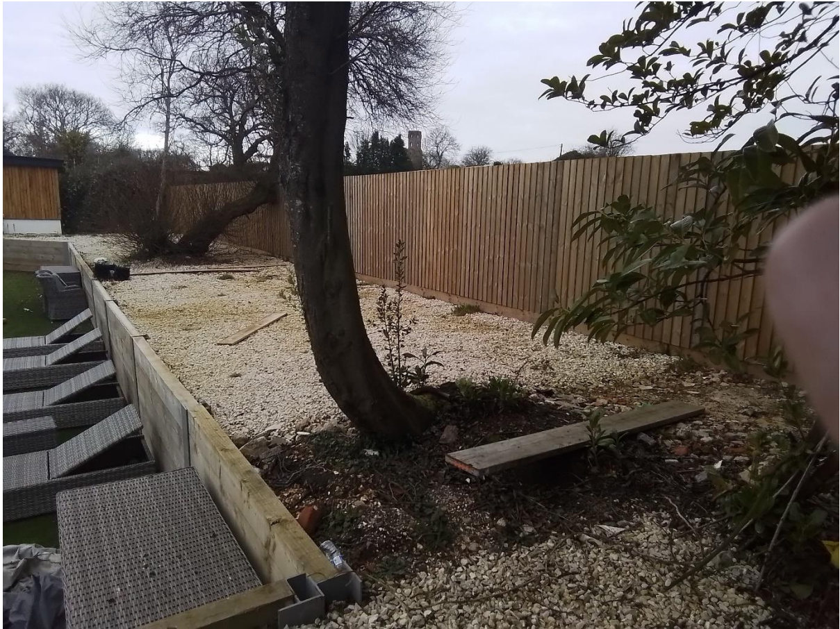
Raised garden to the North