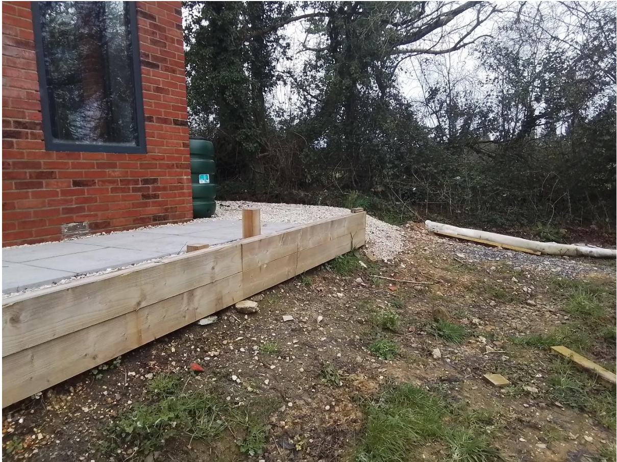
Corner of greenhouse looking NE