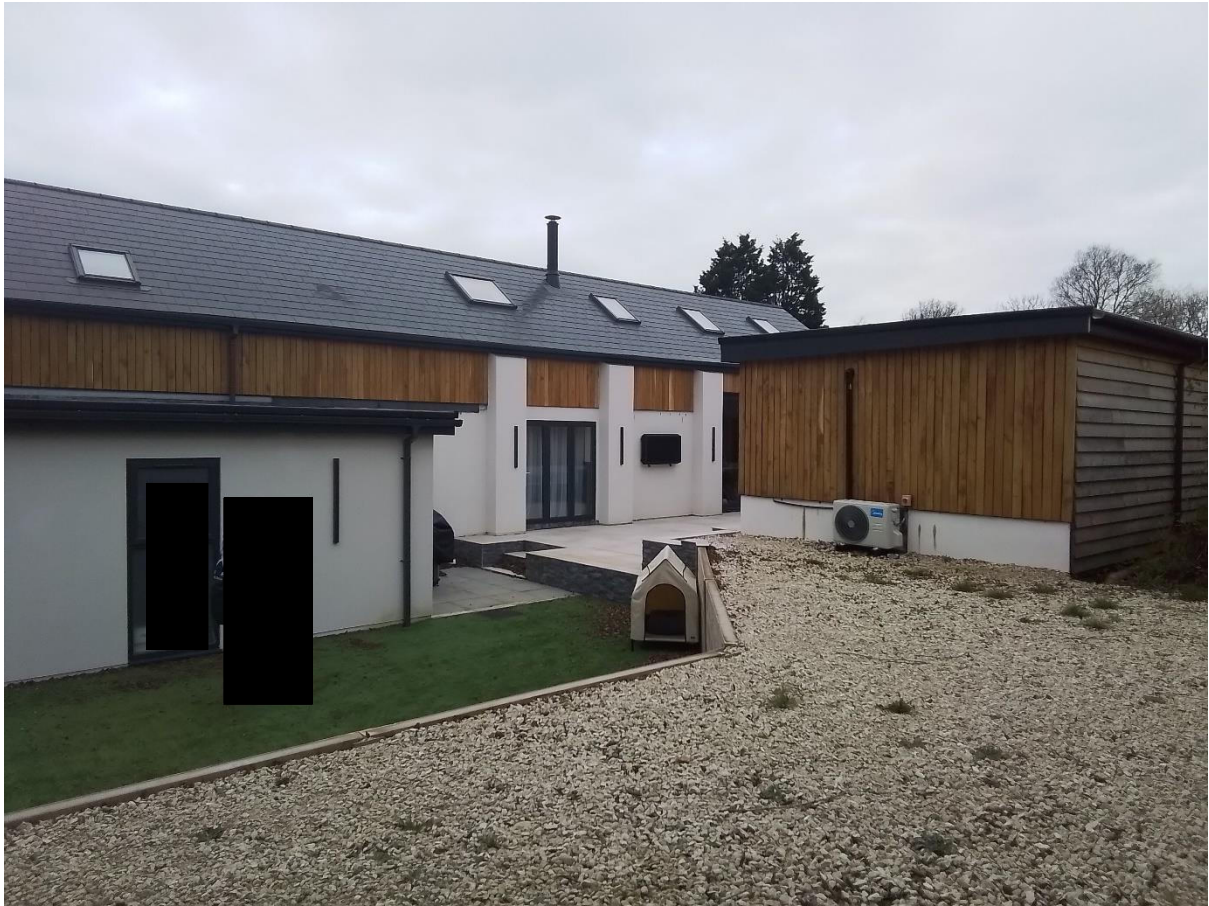
North elevation with annex to the right and wrap around left