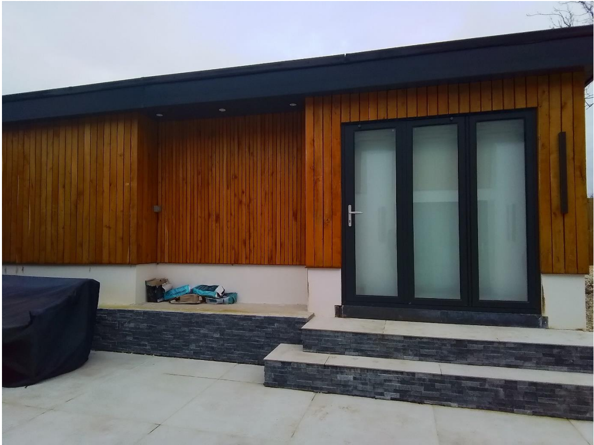
South Front of annex extension looking North