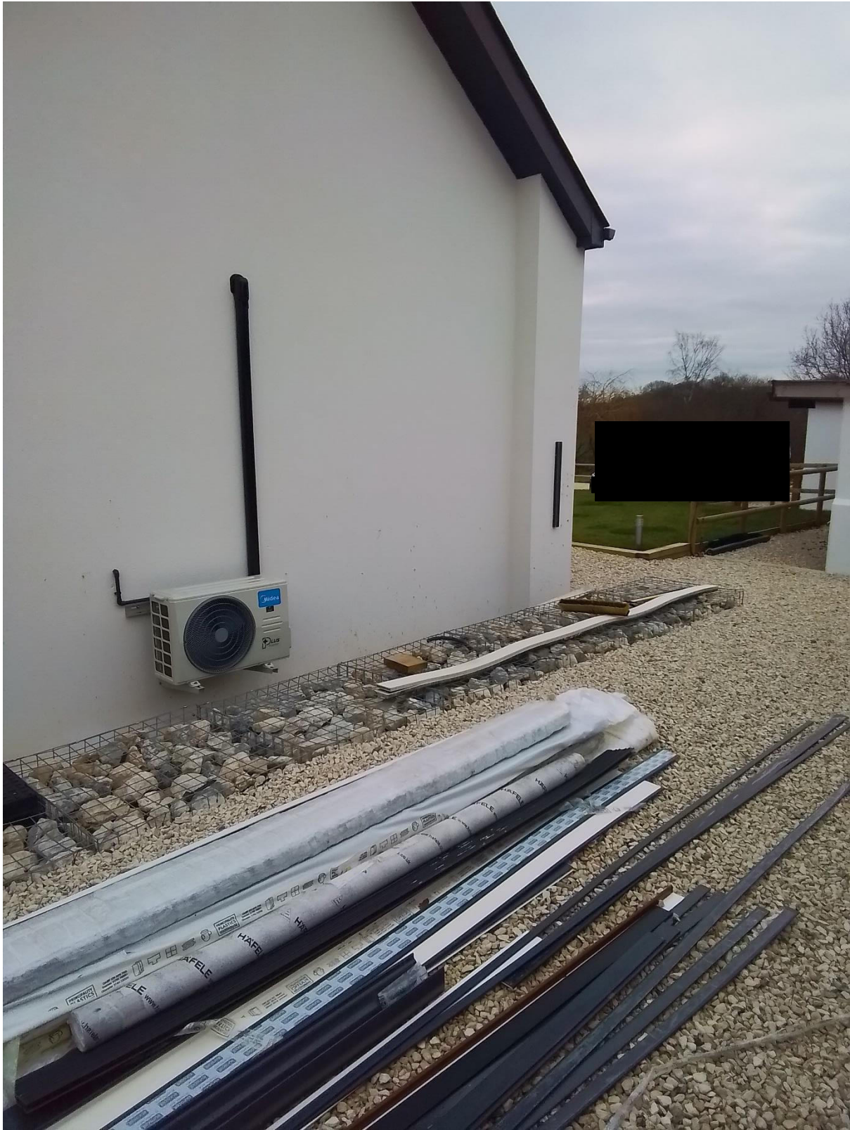
West Elevation of White Barn looking South