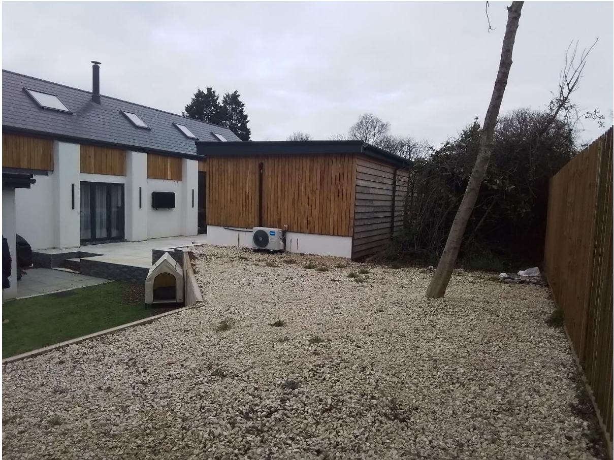
Annex extension in foreground