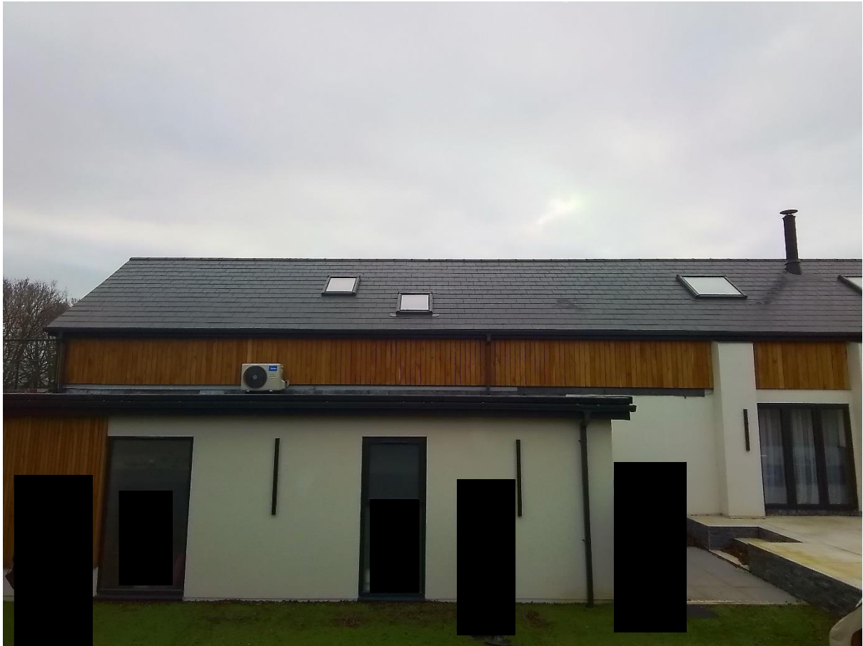
North elevation wrap around extension