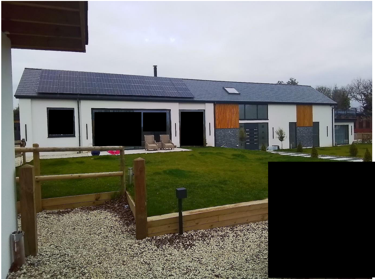
Front Elevation and corner of the drive

Photographs taken by Zoe Linton and Jane Meadows during site visit 8 th January 2024