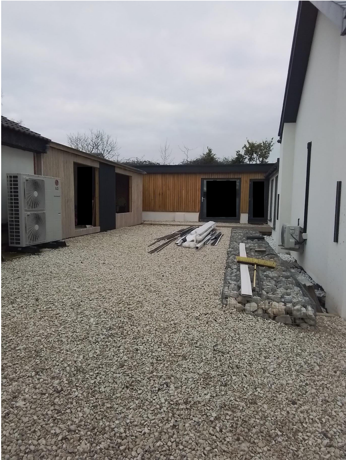
Annex extension looking North White Barn on right