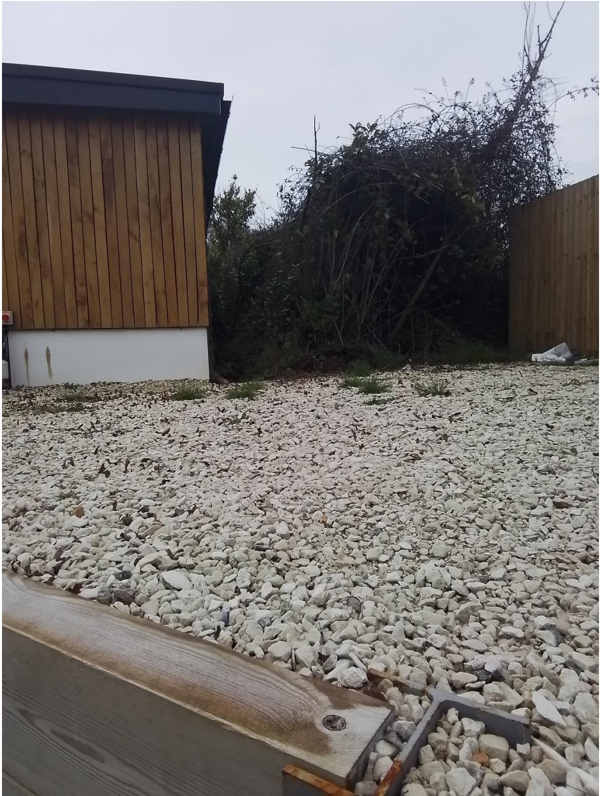
Rear of annex extension and raised garden