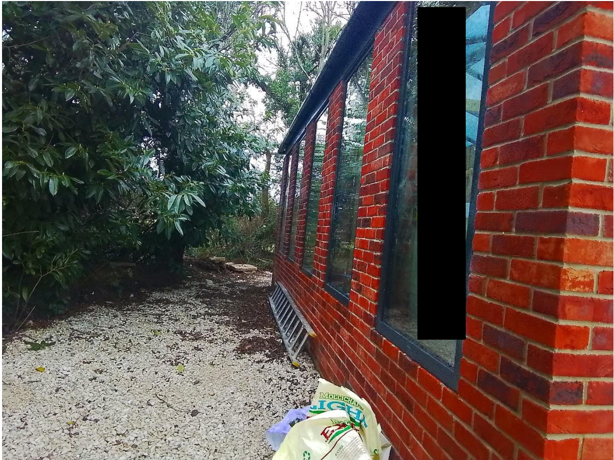
rear northerly elevation of greenhouse