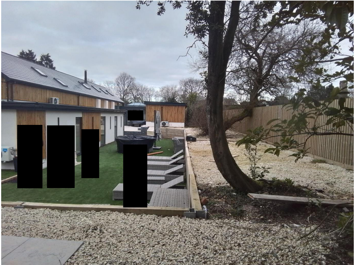
North elevation of White Barn, wrap round extension and retaining walls