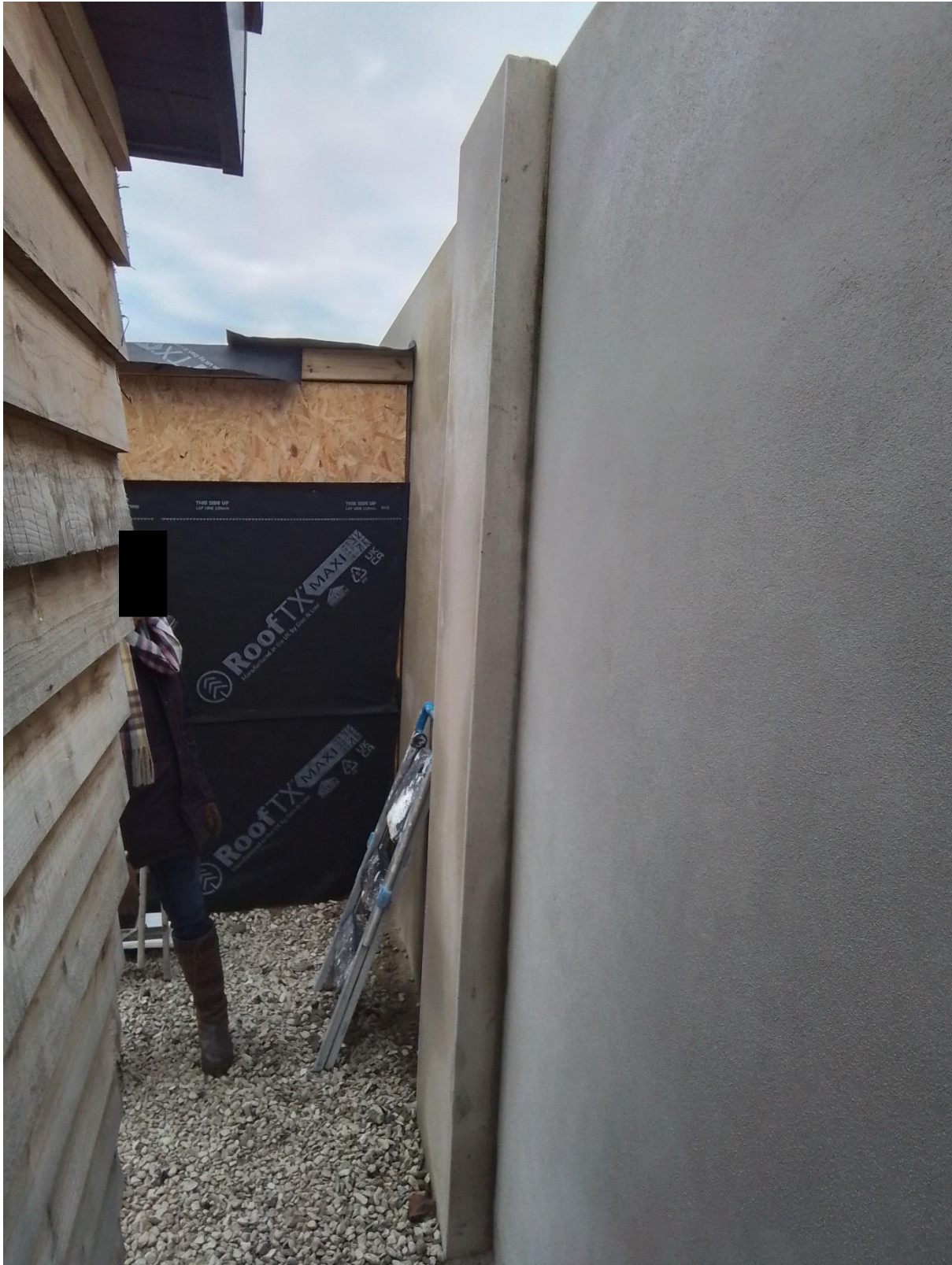
Corner of annex and looking toward unfinished shed