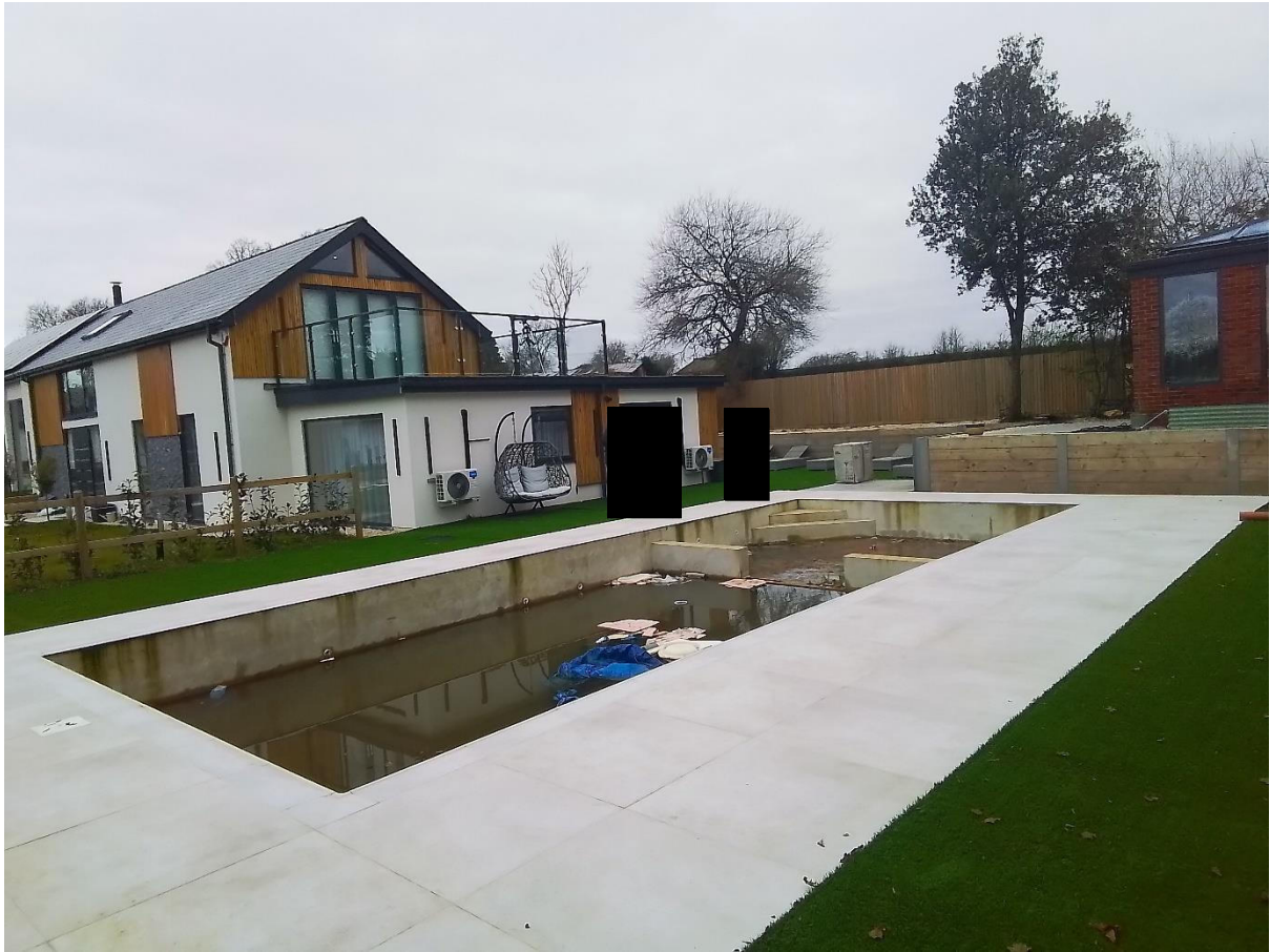
Swimming pool and SE corner including greenhouse