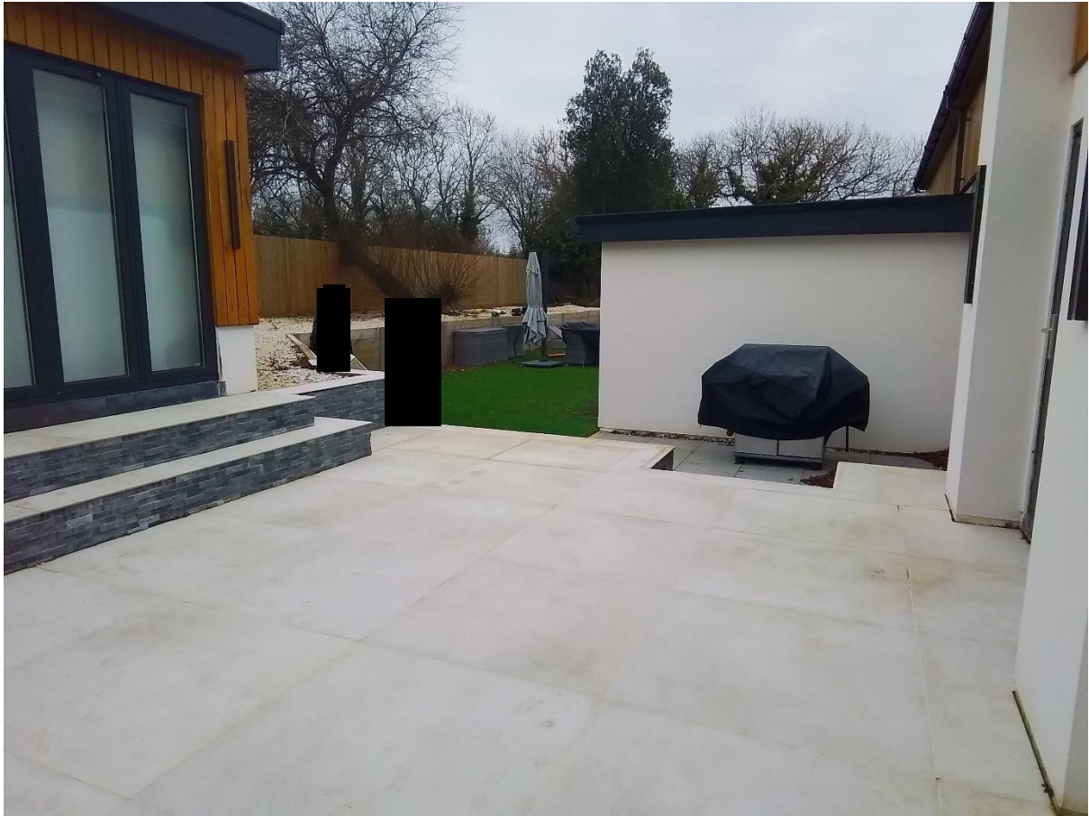
Rear of White Barn looking NE from connecting corridor