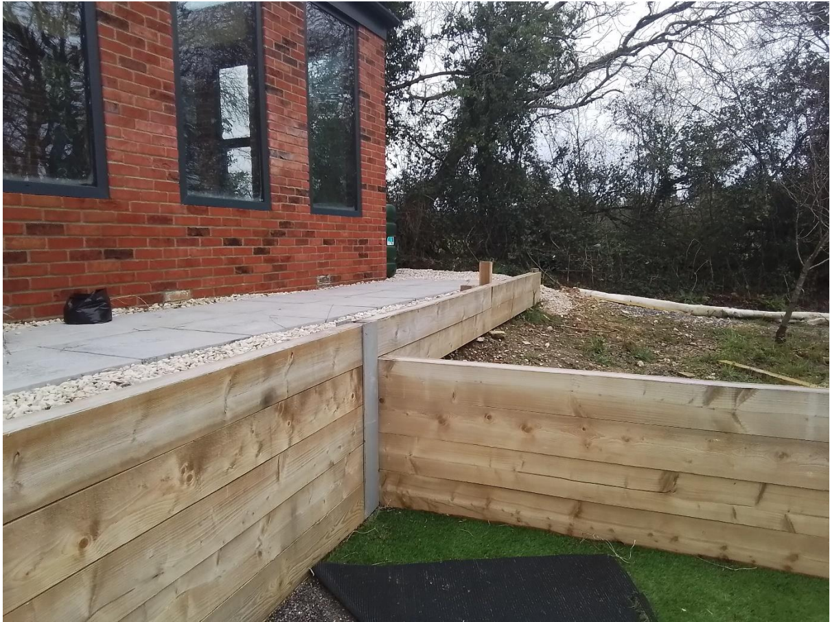
Corner of greenhouse and retaining walls