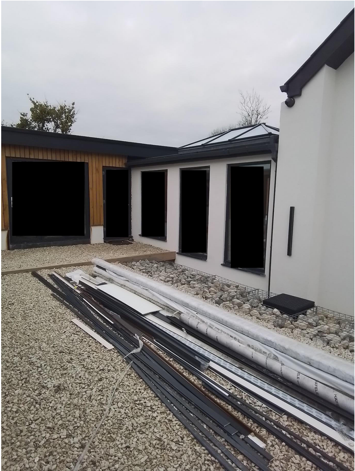
Connecting corridor looking North White Barn to the right