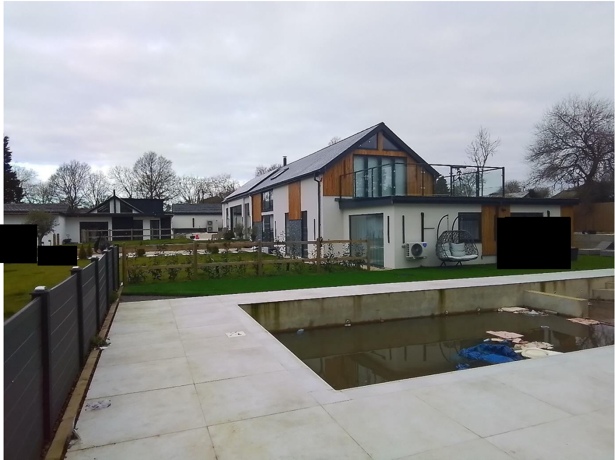
Swimming pool looking at the south east corner of White Barn