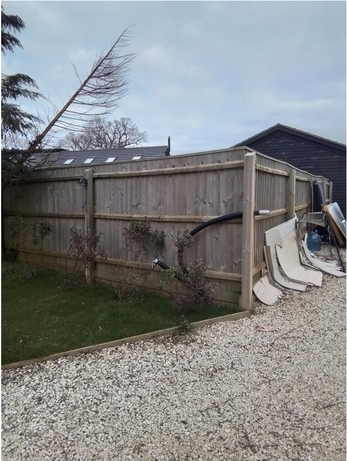
Dividing fence corner between Anchor Paddock and White Barn in front of garage