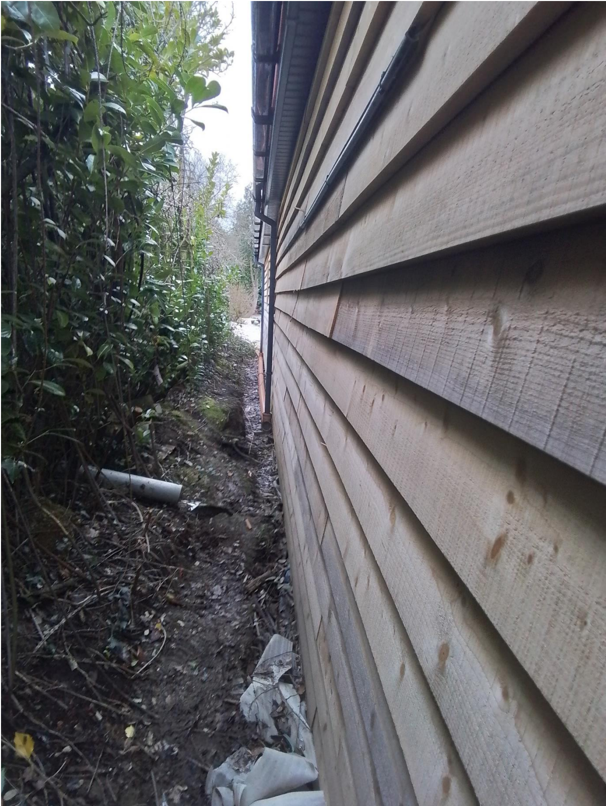
Rear of Annex to White Barn