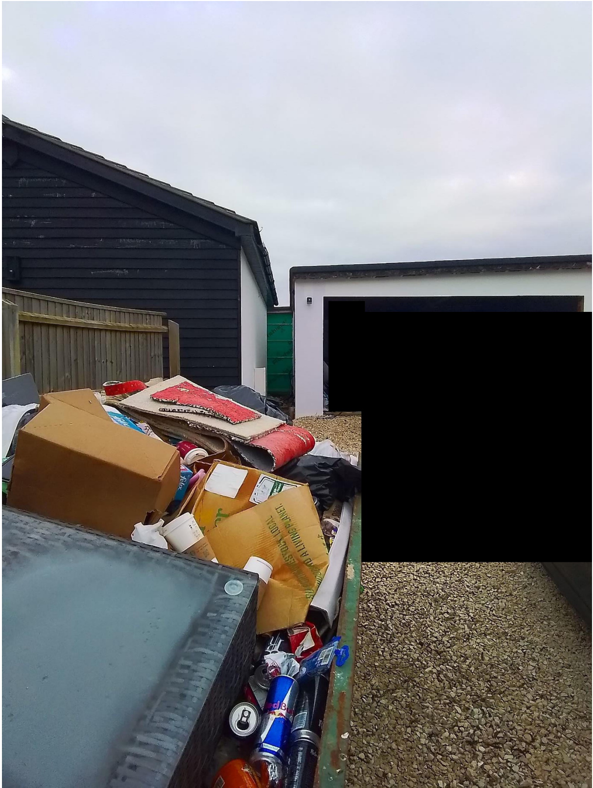
Garage White Barn