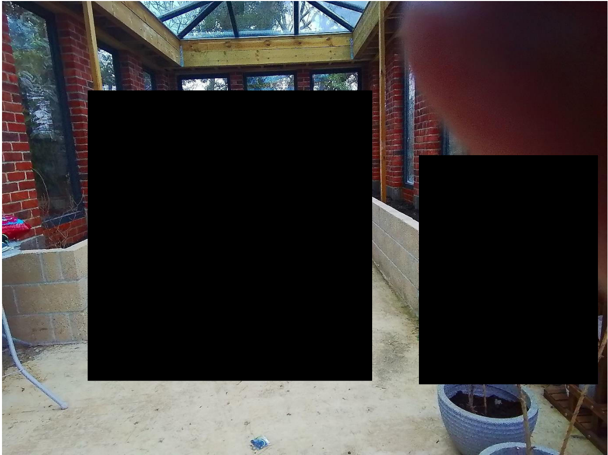
Internal view of greenhouse