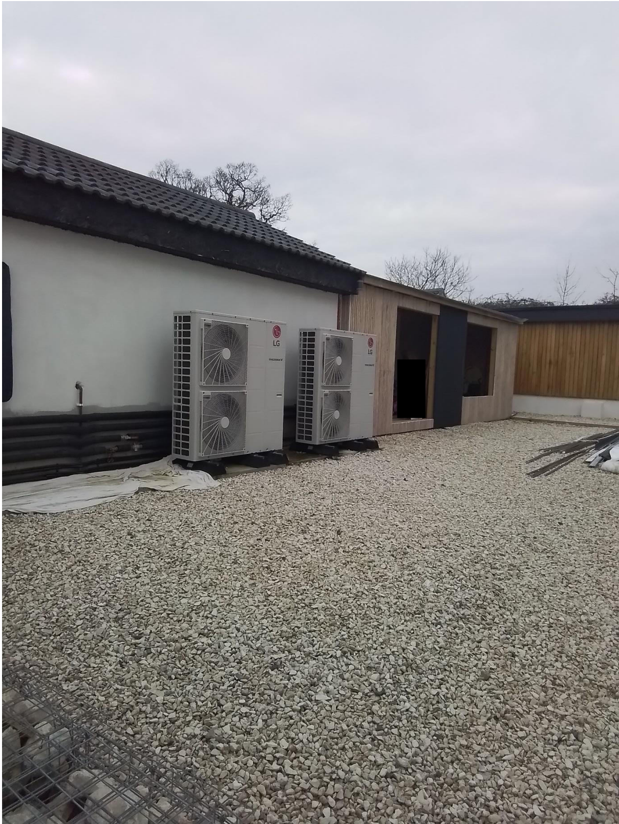
Rear of Anchor Paddock outbuilding & unfinished shed White Barn