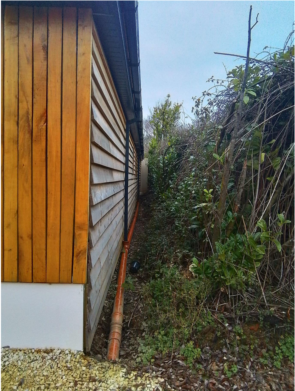
Rear of annex extension