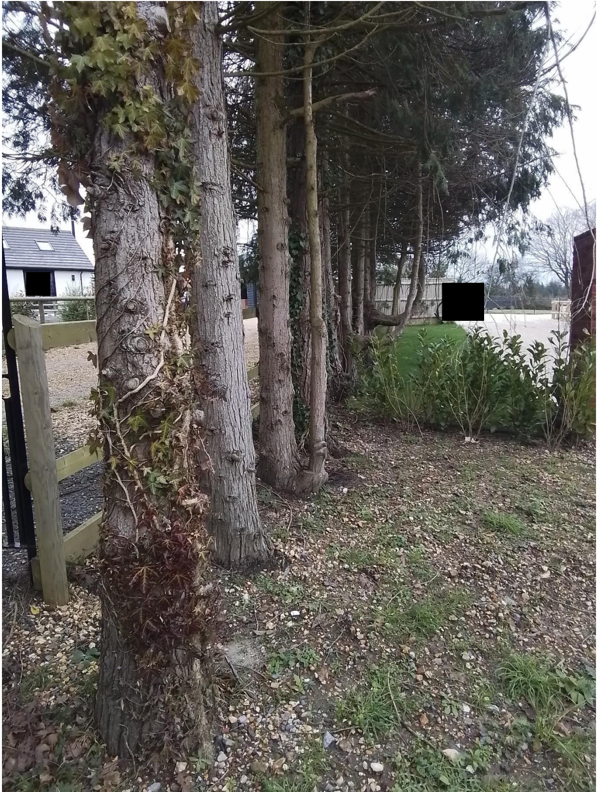
Boundary between Anchor Paddock and White Barn