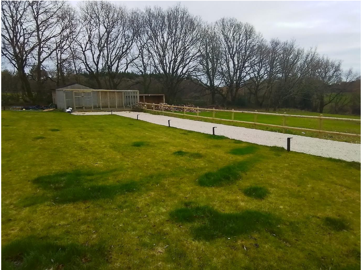
Chicken Coup and hardstanding