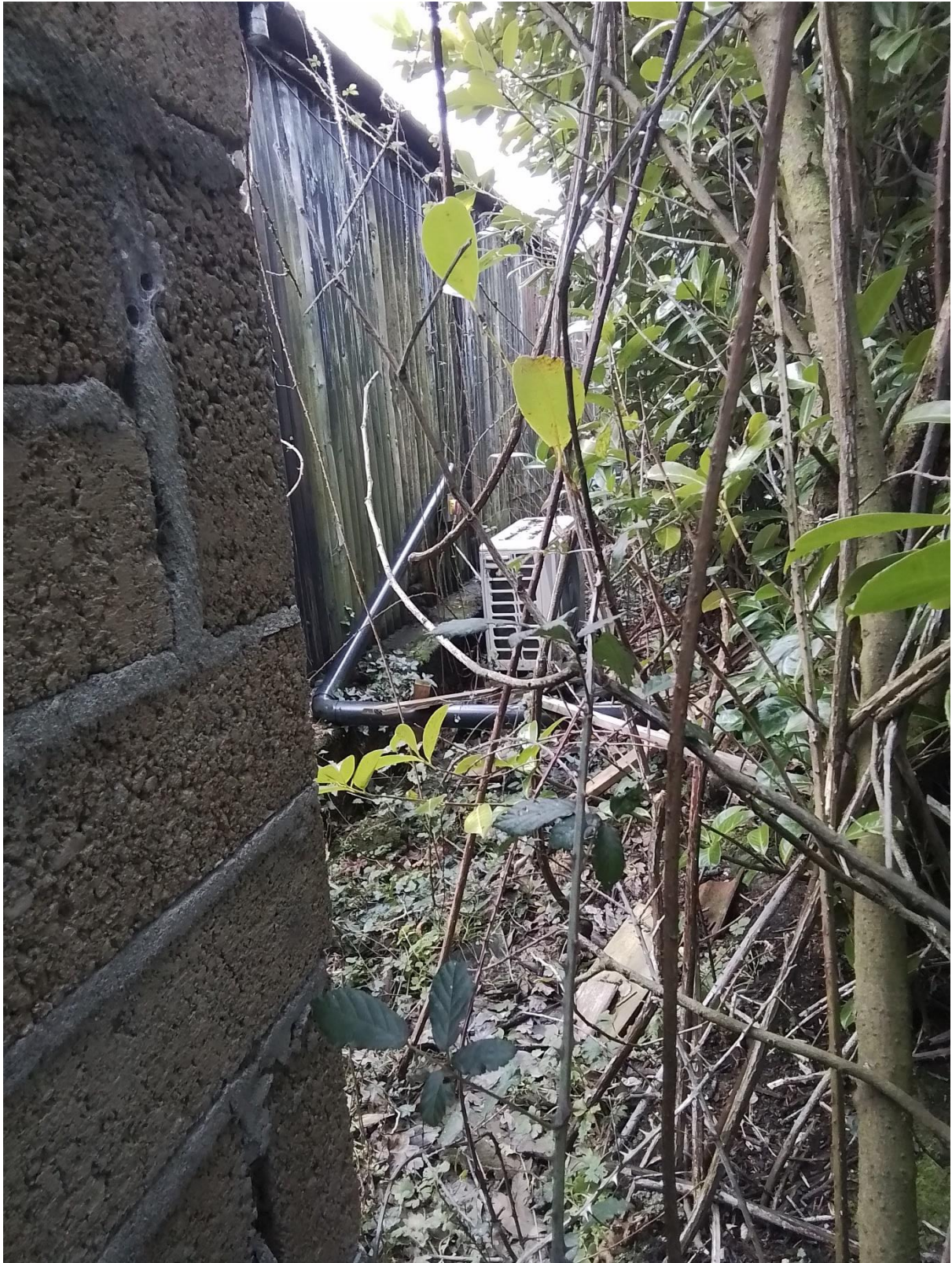
View between Anchor Paddock Outbuildings and White Barn outbuildings