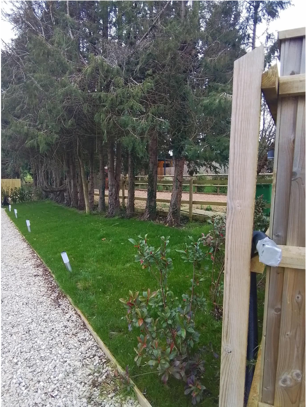
Boundary between Anchor Paddock and White Barn looking back toward entry gate