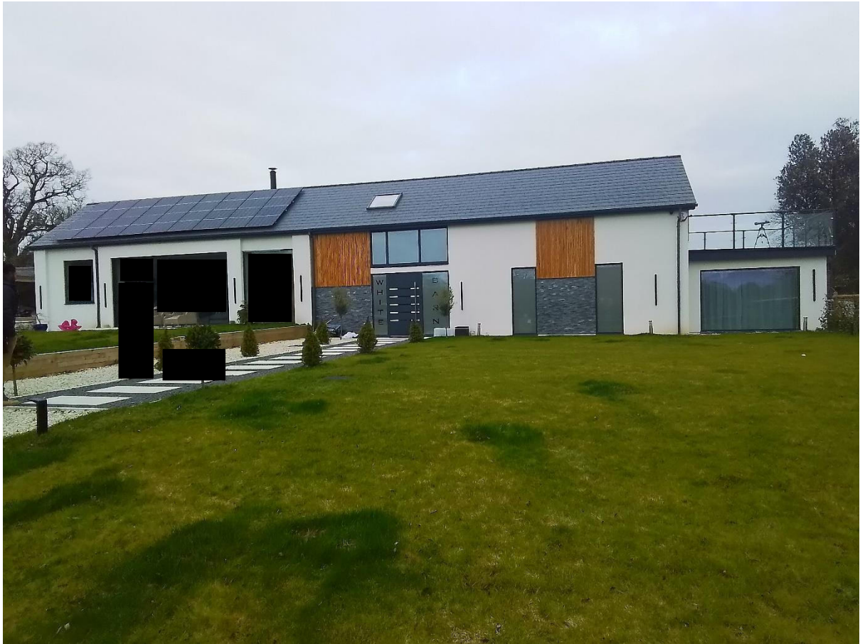
Front elevation including eastern extension