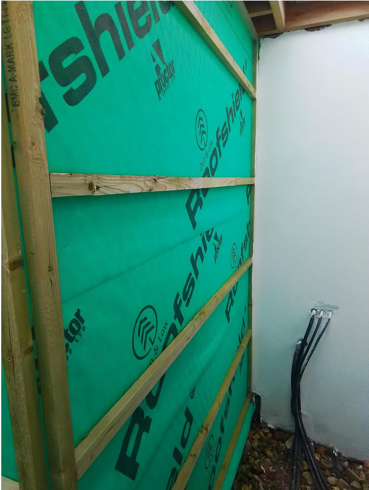
Rear of outbuildings White Barn 2