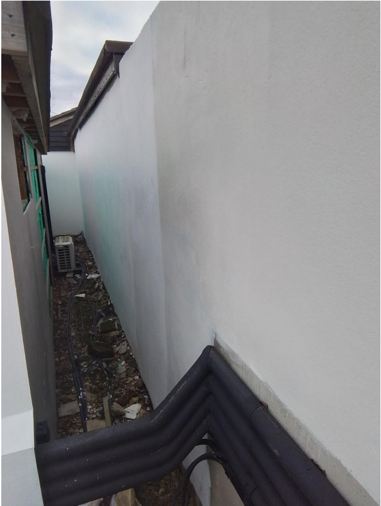
Rear of outbuildings White Barn 3